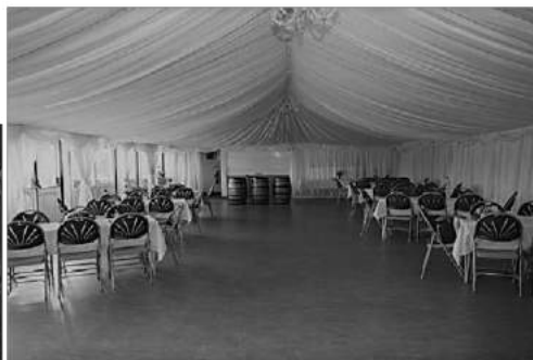
Transformed for a wedding reception

Our stylish coffee shop can be hired for exclusive use